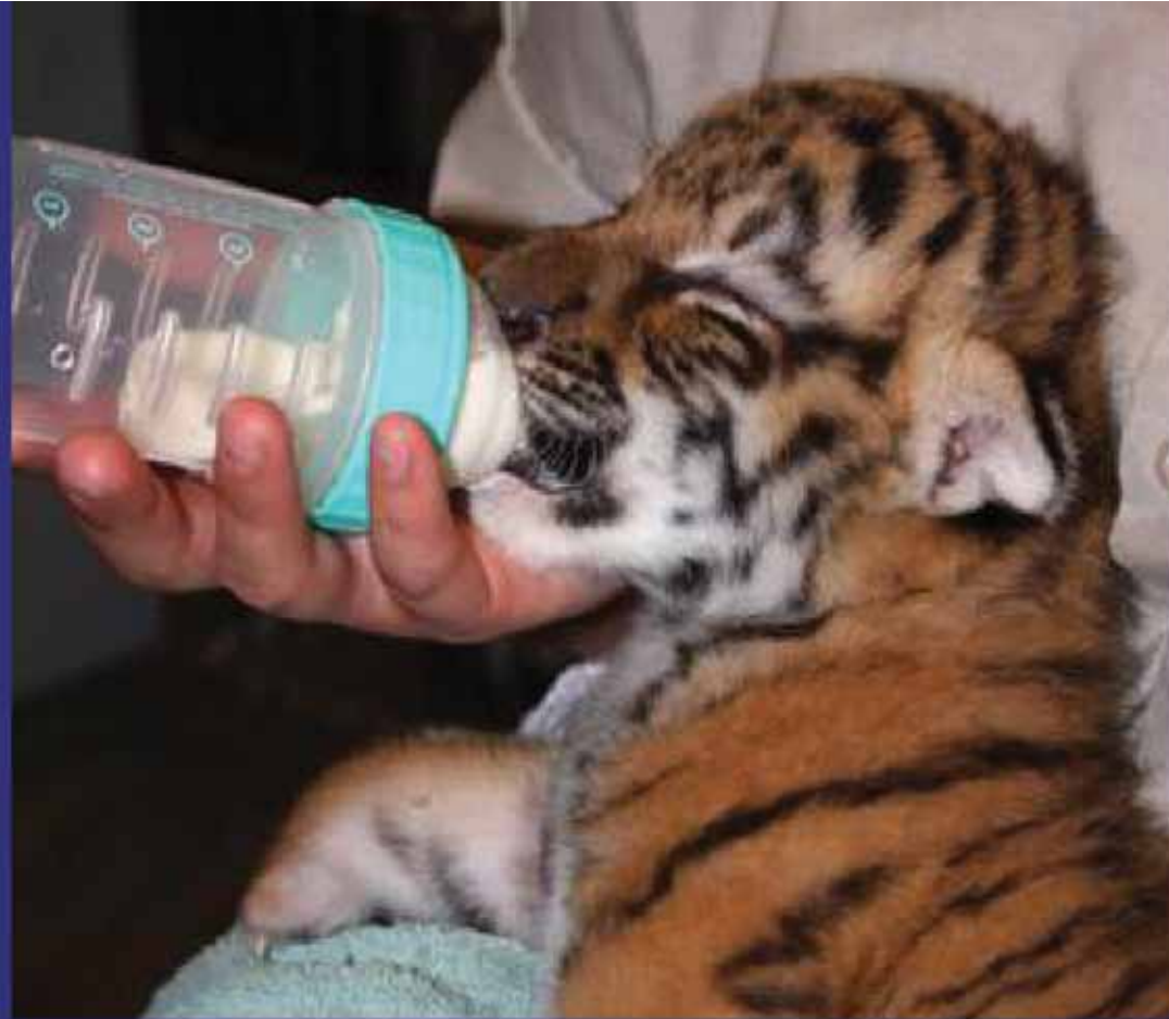
This Amur tiger cub was born in captivity at the Great Plains Zoo in Sioux Falls, South Dakota.

The SSP created a master plan for managing tigers with recommendations for mate selection, shipping conditions for breeding animals, and supporting programs that protect the species in the wild. In 1992, it was decided that 100 tigers from each subspecies should be kept in captivity. These tigers have been raised in zoos across North America in cooperation with tiger conservation programs in Europe, India and Southeast Asia. Other international tiger programs also exist, including the Tiger Global Animal Survival Plan (GASP), which devised several areas of scientific study, such as molecular DNA studies, that are thought to be critical for the survival of tigers worldwide. There have also been advances in other scientific programs, such as in the fields of genome banking, in vitro fertilization and contraception.