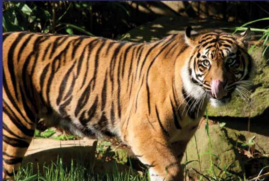
Damai, a Sumatran tiger, lives at the National Zoo in Washington, D.C.

Since the 1970s, there has been a growing effort to preserve the number of tigers in the wild and increase the numbers in captivity. One of the most important acts, the Species Survival Plan (SSP), was formed as a joint effort by the American Zoo and Aquarium Association and conservation organizations, whose main goal was to establish and manage healthy endangered animals in captivity.