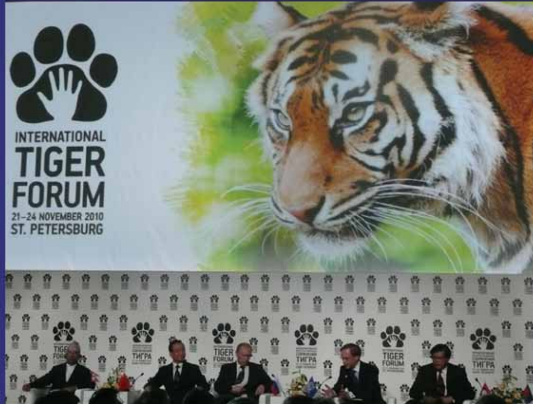
World leaders attend the International Tiger Forum in St. Petersburg, Russia, in 2010.

For the past 40 years, there have been many international and national laws, guidelines and regulations for the protection of tigers. The most fundamental of these is the Convention on International Trade in Endangered Species of Wild Fauna and Flora (CITES), which specifically bans the international trade of tigers and tiger body parts. To date, 175 countries have signed the CITES agreement. Many regional conservation programs also exist, such as the Global Tiger Forum in India, whose main goals are to eliminate the trade in tiger parts, support efforts to preserve tiger habitat, and promote local training and research in tiger conservation. Several local governments in Asia have also enacted laws to protect tigers.