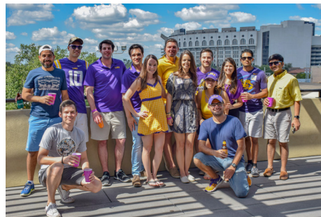
Recent graduates and soon-to-be alumni, most with graduate degrees from our department.