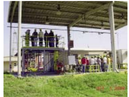
Introduction to production control and safety systems using fullscale production skid at PERTT Lab (PetE 3037).