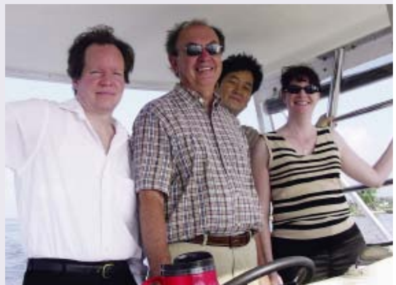
The faculty went on a retreat in Slidell, LA in August 2008. Above are some photos of a boat ride we took while discussing the program.