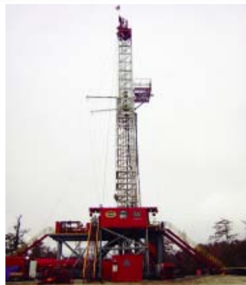
Picture 2: Anderson-13 #1 horizontal producer spudded on November 13, 2008.