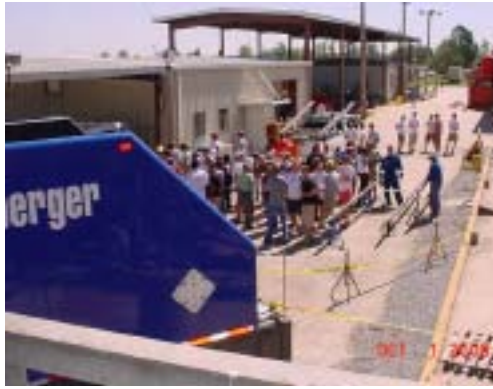
Logging Demonstration provided by Schlumberger for PetE 3036 on October 1, 2008 using PERTT Lab #2 Well.

Equipment testing and training work for MI-Swaco, Secure Drilling, Halliburton and T3-Energy are on going at the facility. Most recently, MI-Swaco did some preliminary performance testing a new 15k AutoChoke and improved CD-1400 de-gasser.