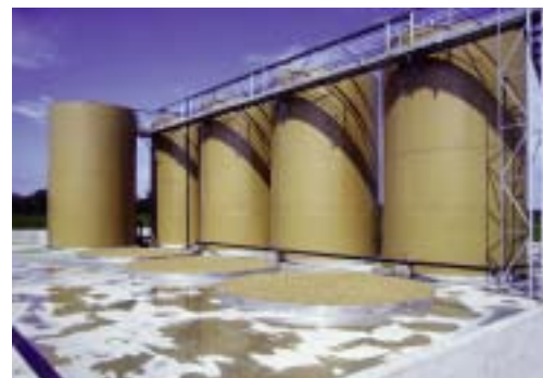
Picture 4: Production containers-750 bbl tanks