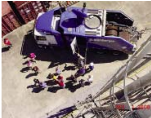
Students touring unit during logging operations (Pete 3036)